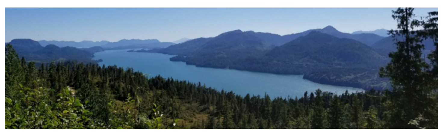
Carroll Inlet in the Tongass National Forest.

In 1988, the GAO reported that USFS timber sales had lost $22.1 million in FY1986,<sup>4</sup> roughly equivalent to $50.6 million in 2018 dollars. As its most recent estimate, the GAO reported in 2016 that Tongass timber sales had lost $11.4 million per year on average during the period FY2005-2014. The agency was careful to note, however, that its estimate excluded USFS roadbuilding costs.<sup>5</sup>