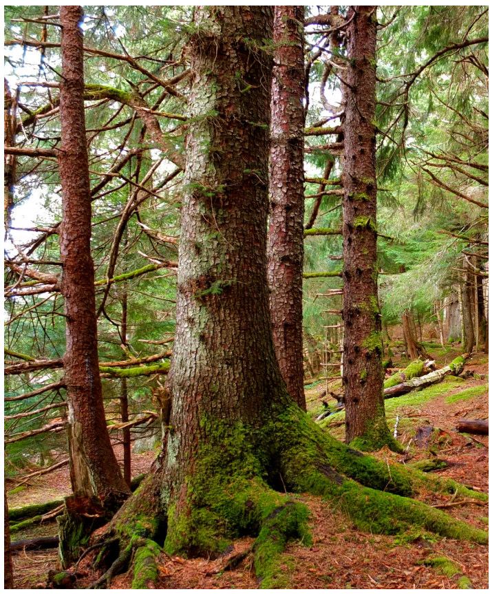
Tongass trees.

"salvage" timber—timber that is dead, damaged, downed by other natural means, or otherwise in need of clearing—and uses its funds to prepare and administer future salvage sales.