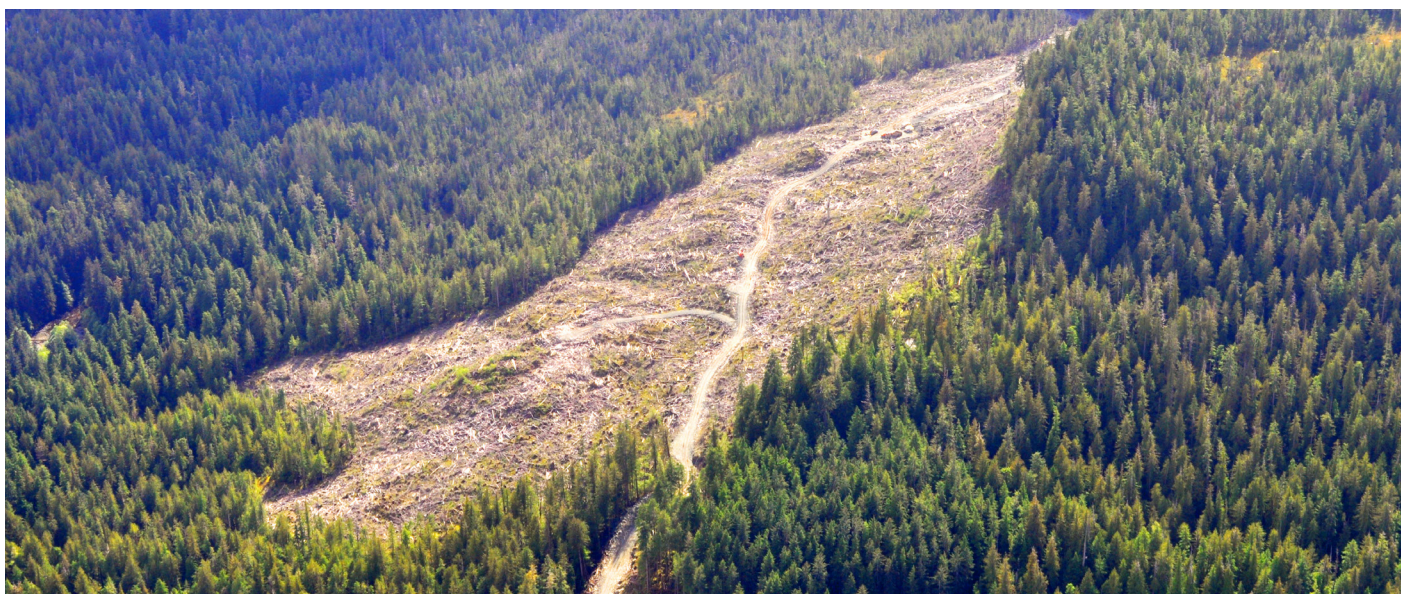
Clearcut timber harvest in the Tongass National Forest on Prince of Wales Island, AK. Photo used with permission.

The U.S. Forest Service (USFS) within the Department of Agriculture manages 193 million acres of public forests and grasslands collectively known as the National Forest System. The Tongass National Forest (Tongass) in southeast Alaska is the largest national forest at 16.8 million acres, roughly the size of West Virginia. Every year, the USFS prepares and conducts sales for the rights to harvest millions of board feet of timber from the Tongass. These sales have historically generated less revenue than the USFS spends to administer them, resulting in large net losses for U.S. taxpayers. New budget data reveal that the USFS has continued to lose millions of dollars on Tongass timber sales in recent years.